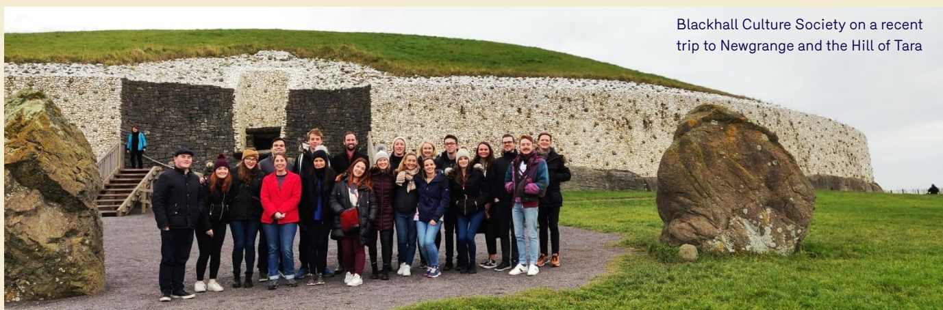
Blackhall Culture Society on a recent trip to Newgrange and the Hill of Tara