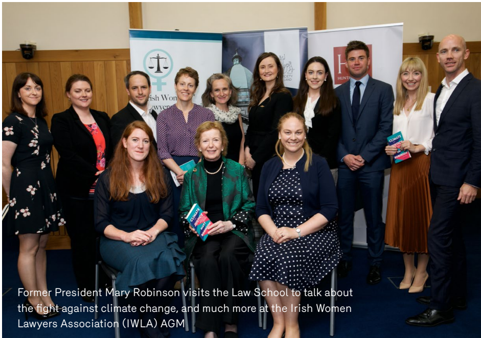
Former President Mary Robinson visits the Law School to talk about the fight against climate change, and much more at the Irish Women Lawyers Association (IWLA) AGM.