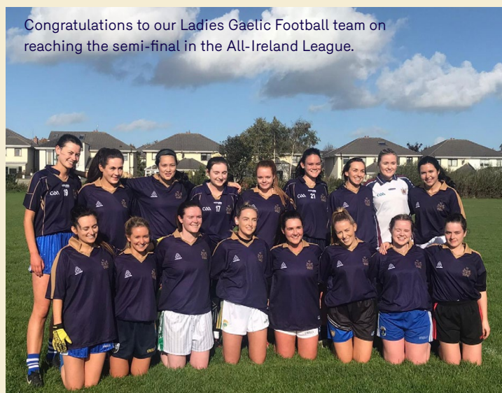
Congratulations to our Ladies Gaelic Football team on reaching the semi-final in the All-Ireland League.