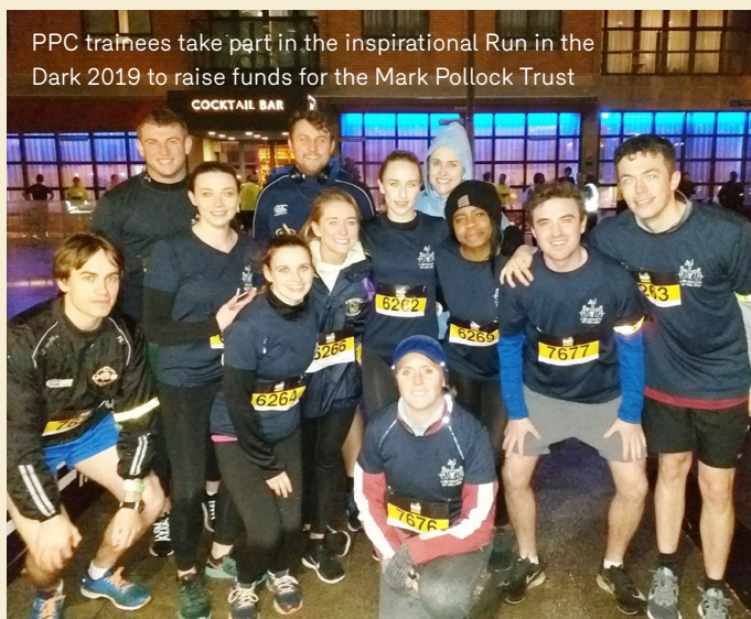
PPC trainees take part in the inspirational Run in the Dark 2019 to raise funds for the Mark Pollock Trust

New trainee solicitors have thrown themselves into the Blackhall experience with a variety of volunteering, social and extra-curricular events, all supported by Student Development Services ( SDS ).