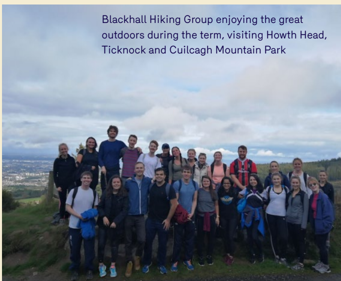
Blackhall Hiking Group enjoying the great outdoors during the term, visiting Howth Head, Ticknock and Cuilcagh Mountain Park