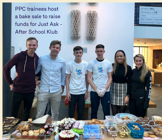
PPC trainees host a bake sale to raise funds for Just Ask - After School Klub