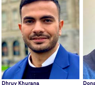
Eversheds Sutherland LLP