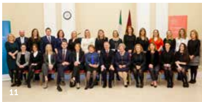
21 Certificate in Public Legal Education, class of 2017