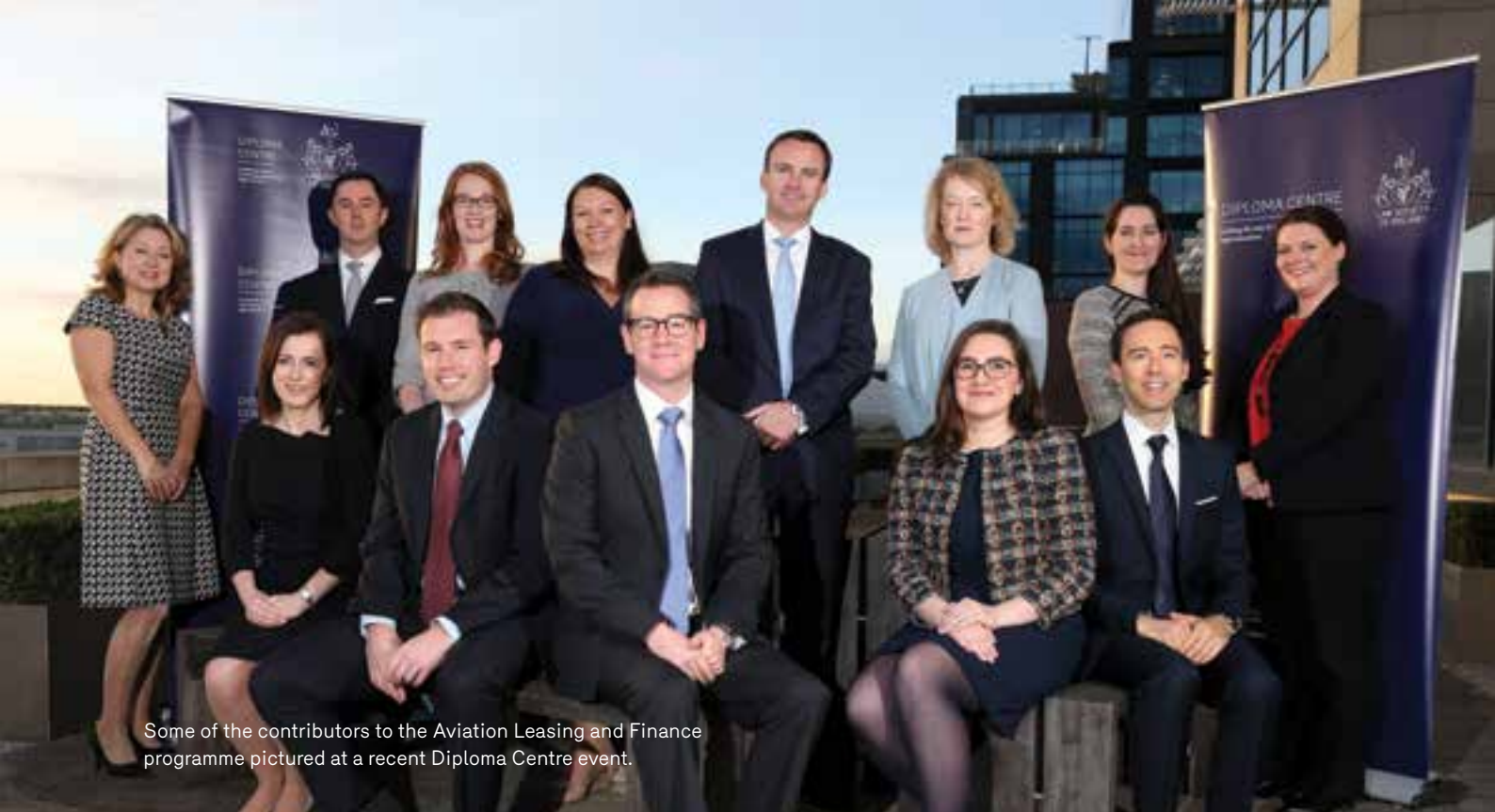
Some of the contributors to the Aviation Leasing and Finance programme pictured at a recent Diploma Centre event.