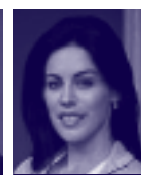
Dr Jennifer Carroll MacNeill BL