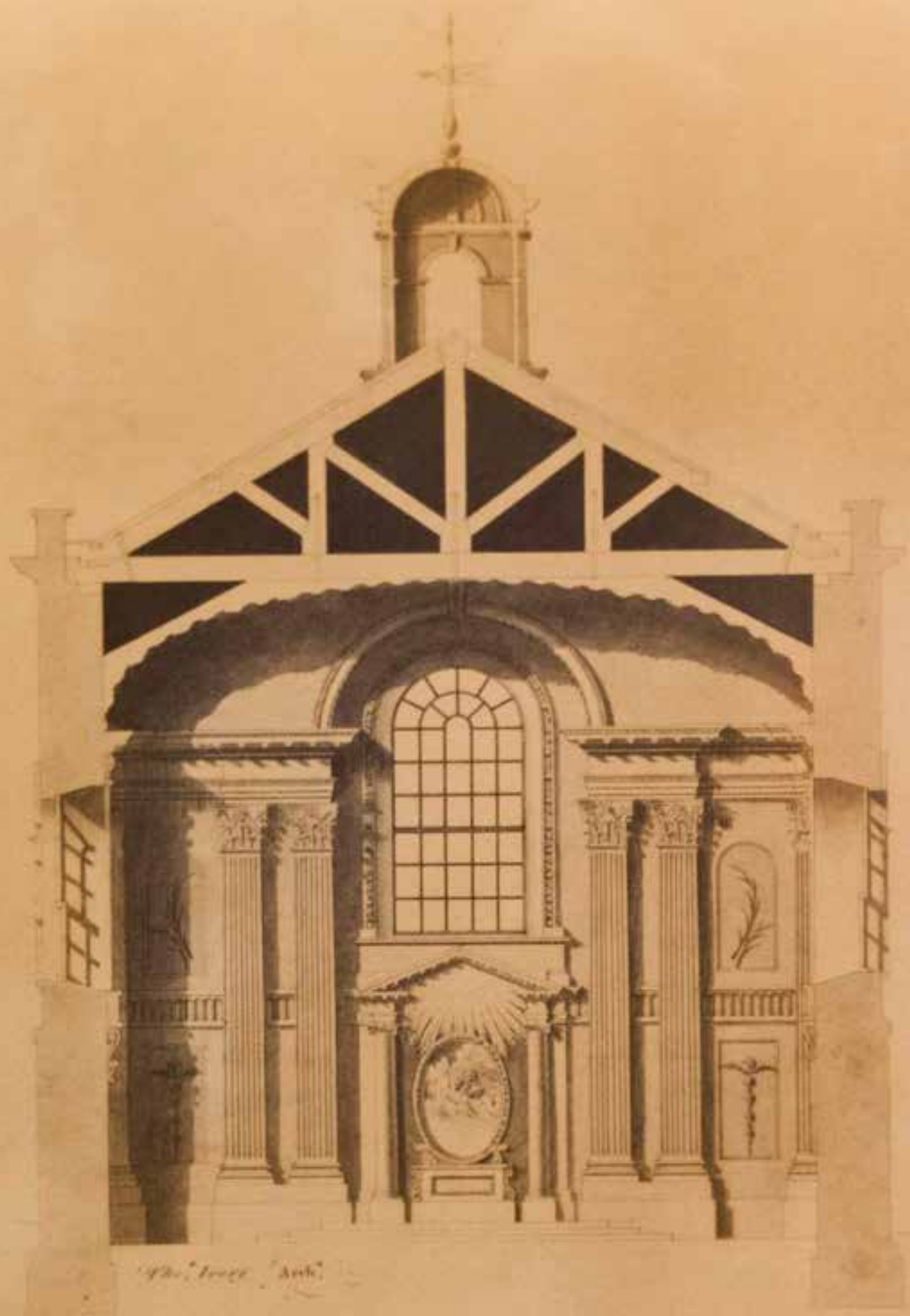
The East End

The East End of the Chapel of the New College