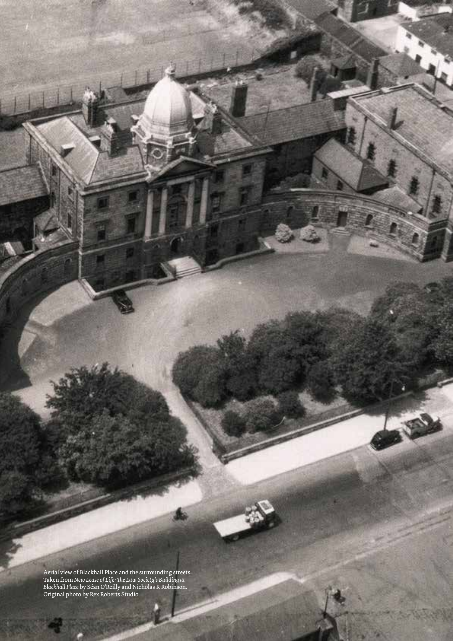
Aerial view of Blackhall Place and the surrounding streets. Taken from New Lease of Life: The Law Society's Building at Blackhall Place by Séan O'Reilly and Nicholas K Robinson. Original photo by Rex Roberts Studio