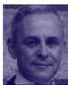
Judge Colin Daly, District Court judge