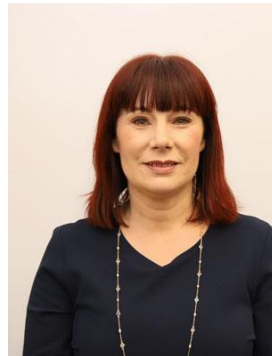
Josepha Madigan TD