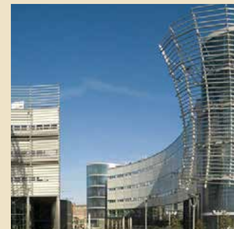
Northumbria University, Newcastle